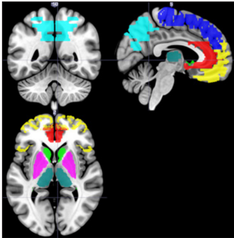
Figure 1. Brain image showing the regions of interests used for analysis. Regions of interest have been labelled using coloured fills. Yellow: orbito-frontal cortex; dark blue: medial frontal gyrus; red: anterior cingulate gyrus; light green: caudate; cyan: lenticular nucleus; dark green: thalamus; light blue: superior parietal lobule and precuneus.

performed (TR = 8.1 msec, TE = 3.7 msec, nutation angle = 8 degree, FOV = 256 mm, slice thickness = 1 mm without interslice gap, NEX = 1, matrix = 256*256) yielding 165 sagittal slices. The voxel size was 1mm*1mm*1mm.